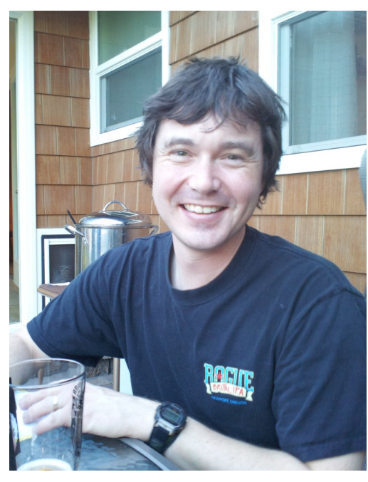
Newest member is "Guy in Blue Rouge Shirt".