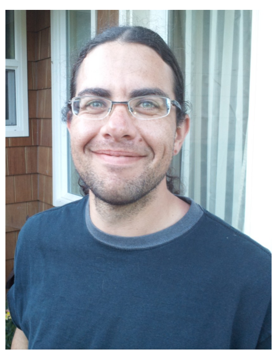
4th and still 2 members short of a six pack is "Other Guy in Blue Shirt" (no relation to Guy in Blue Rouge Shirt).