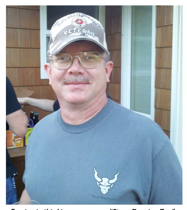
Coming in third is our very own "Stone Brewing Fan".