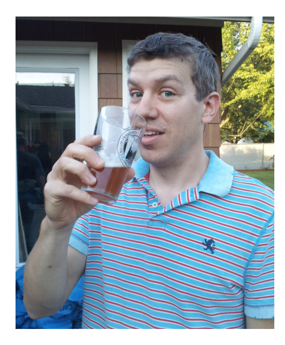
Our second newest member is "Man Drinking Beer".