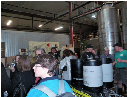
Seven Brides recently moved to new facility that was formally a lumber yard.