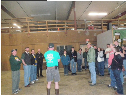
Head brewer addresses club