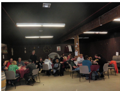
They wisely put us in a separate room for lunch!