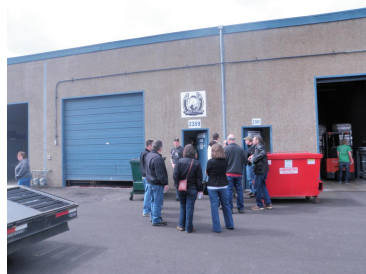
at a non descript storage facility