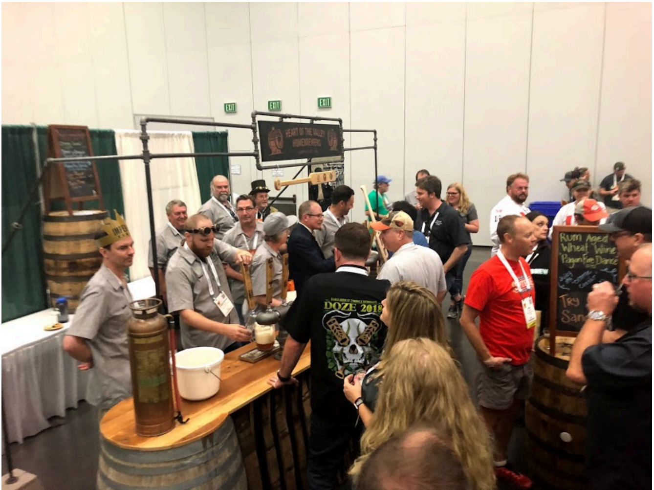
AHA attendees waiting in line for our delicious offerings at the HOTV booth during Club Night.