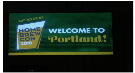
HOTVers got to take in 3 days packed full of information and beer!

In addition to all of the educational sessions attended by HOTVers, we also hosted a Social Hour and Club Night during the conference. The HOTV booth and club brews were well received by all in attendance.