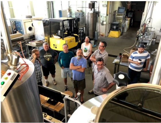
HOTV members get a tutorial on the new OSU brew system.