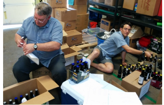
It takes a lot of volunteer effort to pull off the competition.

We want to thank everyone that helped make this year's event a success!