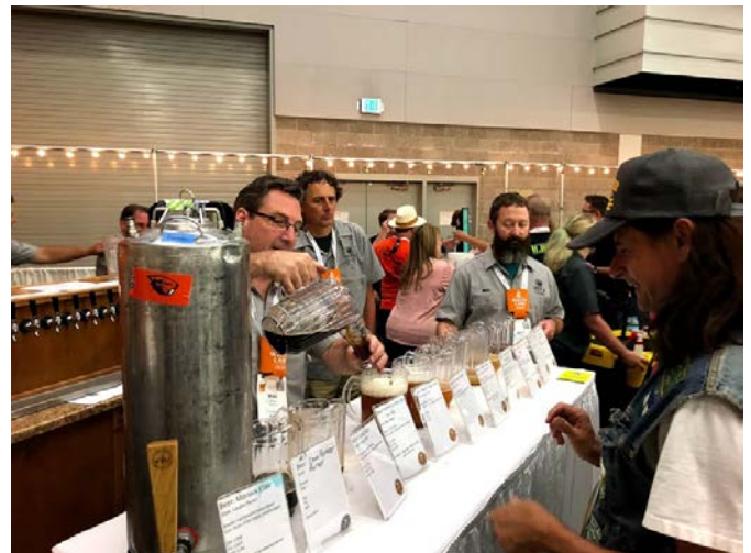
AHA attendees anxiously await HOTV brews during Social Club at AHA. Club members were wearing their new HOTV Brew Club shirts at the event!