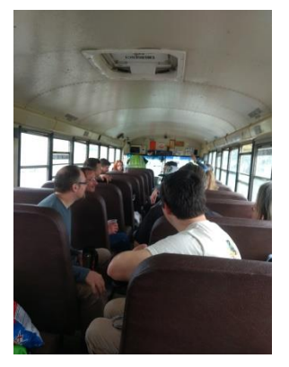
HOTVers anxiously awaiting to sample the breweries of Newberg and McMinnville.

e, blend, and bottle unique, small-batch beers exhibiting the beautiful wildness of