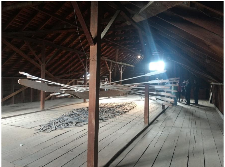
Not exactly what you'd expect in an old barn above the brewery and tasting room. This should be enough of a tease to get you to visit Wolves and People to get the full story!

(some even propagated from our own fruit trees), occasional homegrown hops and fruits, and house sour cultures, we create, age, blend, and bottle