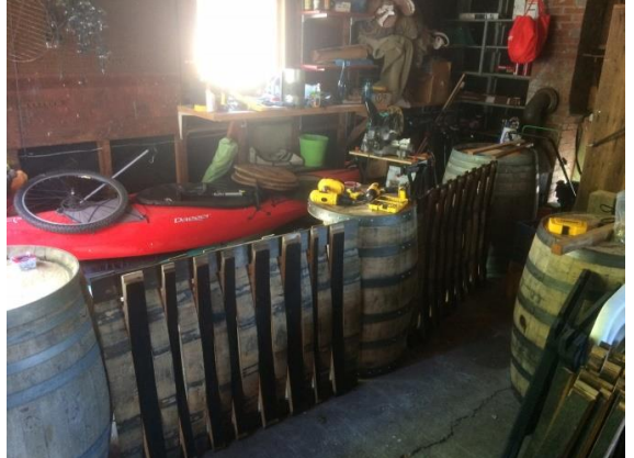
The front panels are constructed and it is starting to come together.

Septembeerfest, so everyone will have an opportunity to get to see it in action (and hopefully volunteer to pour some beer through it!).