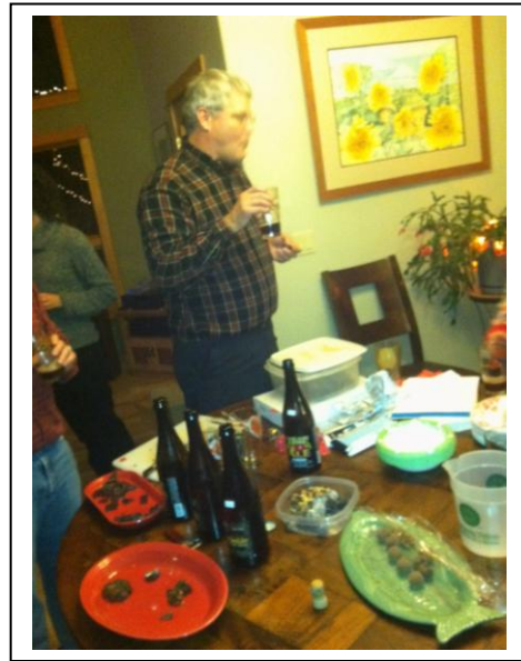
Kendal hosted the Beer and Chocolates