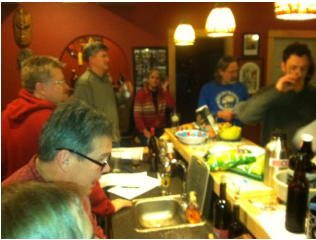
Name that Beer contest

Sorry I don't have more pictures but I was too busy Partying!!!!