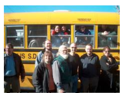
Too Much --The Magic Bus. The name says it all!